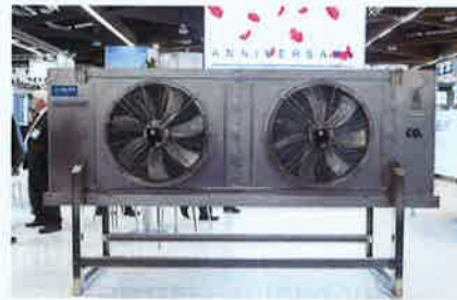
LU-VE LS71H industrial unit cooler

which allows for a low refrigerant charge and is combined with an Inox casing to provide protection in aggressive environments, thus allowing defrost energy savings up to 80%. The Group will also show unit coolers and condensers for refrigerated cabinets and heat exchanger finned packs for commercial refrigeration and air conditioning. The Tecnaïr P series of close control air conditioners which are ideal for data centers will be exhibited for the first time in China.